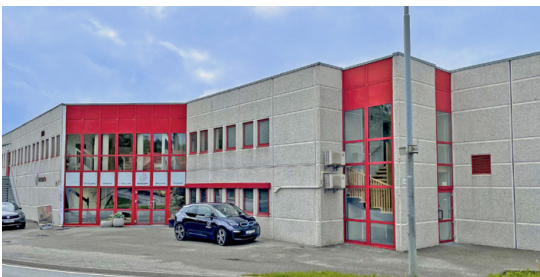
The stair builder has been using Compass Software since the early 1990s.