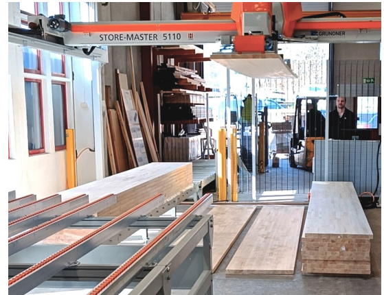
The crane stacks plates into 5 piles made of the same size and material.

Each part can be easily identified at any time by simply scanning a barcode label. Additional CNC code for post-processing can also be generated via a barcode scan.