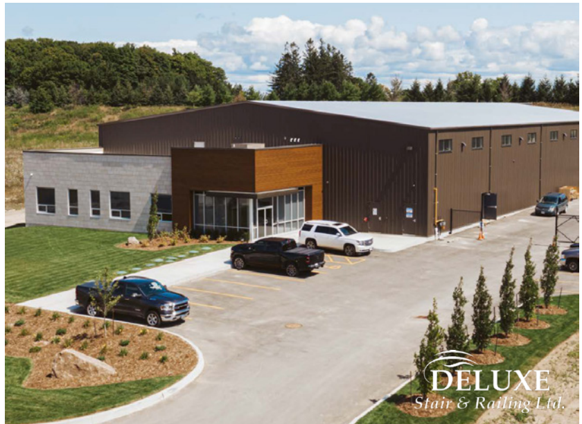
The company has built their own 25,000 square feet woodshop on the Stouffville-Uxbridge border, which was completed in early 2019.

After visiting the WMS, Canada's biggest woodworking trade show in Toronto, and seeing what Compass Software could offer, Jesse and Joe became interested in stair building software for their operation. Still, it was not until late 2017, after the purchase of their 3-axis SCM Pratic Z2 that Deluxe