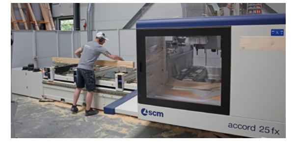
The 3 brand new CNC mashines are controlled with Compass Software.